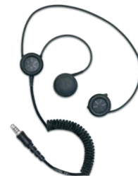
Savox HC-20 dual speaker bone conduction headset